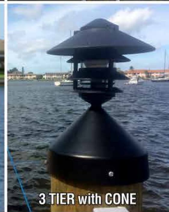
3 TIER with CONE