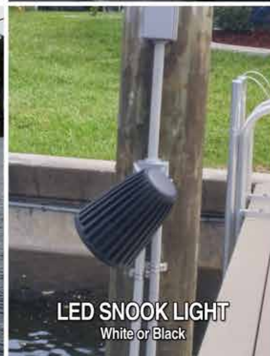
LED SNOOK LIGHT White or Black