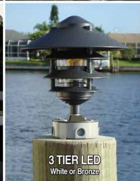
3 TIER LED White or Bronze