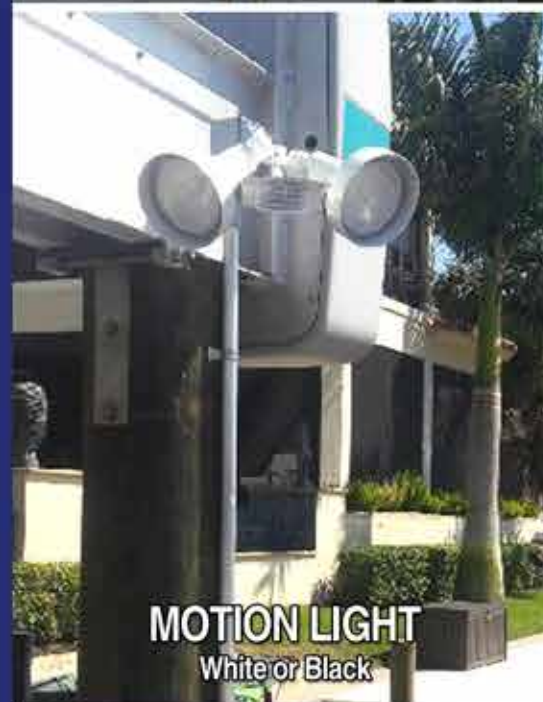
MOTION LIGHT White or Black