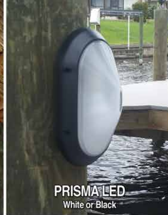
PRISMA LED White or Black